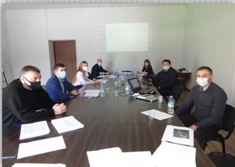
Photo: A scene from the seminar

Following the visit in February last year, I was dispatched to Georgia as a short-term expert from April 4 to May 18, 2021 under the commission of Japan International Cooperation Agency (JICA ). As of May 2021, the number of agricultural cooperatives in Georgia was 979, a small decrease from last year. The number of agricultural cooperative members is 10,278, and the average number of members per agricultural cooperative is as small as 10.5. In addition, some agricultural cooperatives were established in anticipation of future national support, and so-called fake agricultural cooperatives were formed for the purpose of material incentives. The individual members' intelligibility on agricultural cooperatives are generally low.