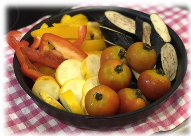
Photo: Summer vegetables