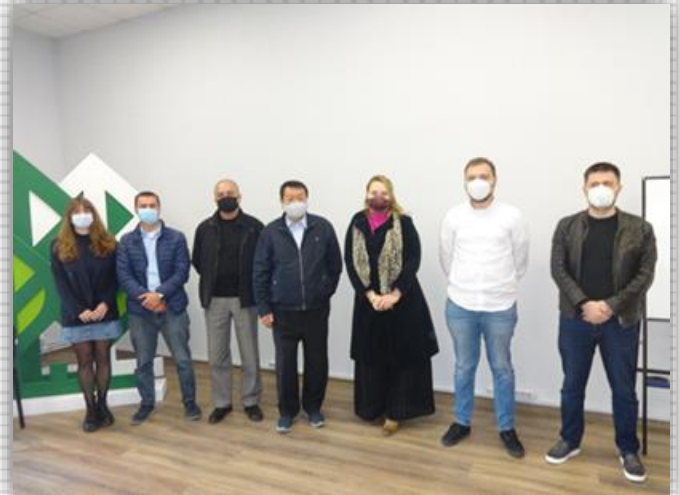
Photo: Seminar participants

Therefore, the Rural Development Agency (hereafter called RDA) has taken the lead in creating a new agricultural cooperative training system and amending the agricultural cooperative law. In addition, RDA is required to formulate a long-term policy for promoting agricultural cooperatives and become the implementing agency for it.