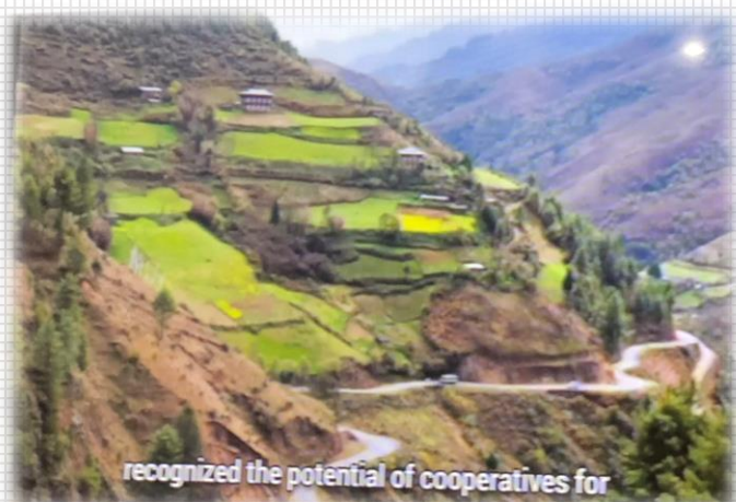
Photo: Video of Bhutan

It started with reports online connecting with ex-participants of Bhutan and Nepal by using video materials covering the situation of agriculture and agricultural cooperatives of the respective countries.