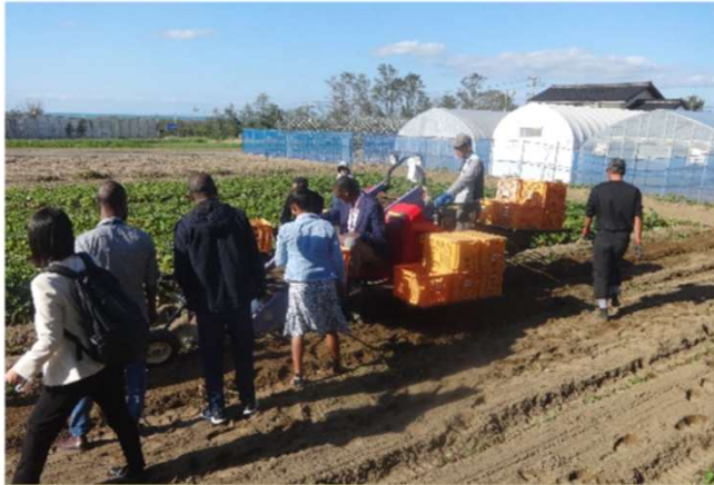
JA Kanazawa Sweet Potato Harvest Experience