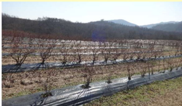
Blueberry orchard, a candidate of a model agricultural cooperative