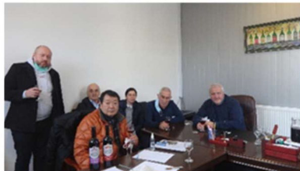
Meeting with the candidate and winery officers for a model agricultural cooperative