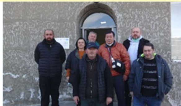
Honey factory for a candidate of a model agricultural cooperative