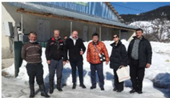
Cheese Processing Plant and for the members for a model agricultural cooperative

Exports of blueberries, honey and wine produced by candidates for model agricultural cooperatives have already started.