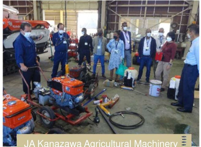
JA Kanazawa Agricultural Machinery Center

The training course was commissioned by the Japan International Cooperation Agency (JICA) Hokuriku Center for the participants from Ethiopia who came to Japan. In the first week, they presented inception reports and attended lectures on value chains at JICA Tokyo.