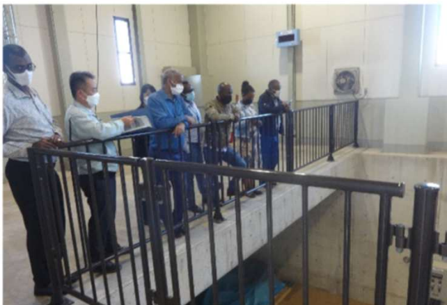
Visit to a small hydroelectric power plant of Tedorikawa-shichika Water Supply Land Improvement District

After that, the participants moved to Kanazawa City, Ishikawa Prefecture to have lectures on production area development, branding, and sales strategies at the administrative agencies based there. They visited Ishikawa Agricultural Center, JA Kanazawa City, Hakui City, Hakui Machizukuri Corporation (on case studies of 6th industrialization), Tedorikawa-shichika Water Supply Land Improvement District, Nagano Karasawa Agricultural Machinery Service Corporation, AI Plaza Kanazawa (supermarket), Ishikawa Central Fruit and Vegetable Corporation, and Kanazawa Daichi Corporation (on the subjects of organic produce export and 6th industrialization).